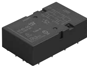
4 Form A 4 Form B