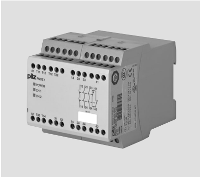
Safety relay for monitoring E-STOP pushbuttons and safety gates.