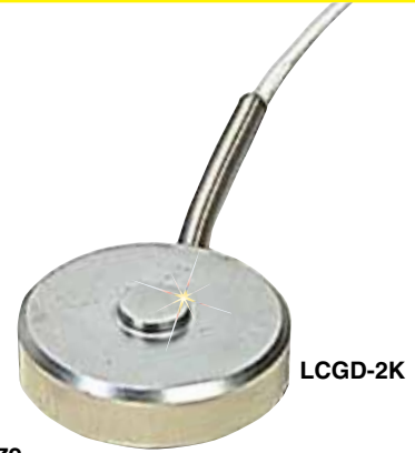
Shown actual size.