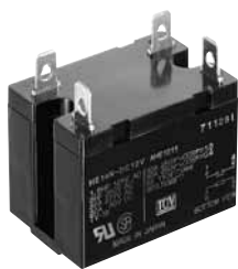
1 Form A Plug-in type