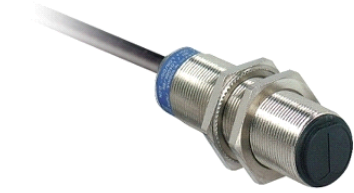
photo-electric sensor - XU2 - thru beam - Sn 15m - 24..240VAC/DC - cable 5m