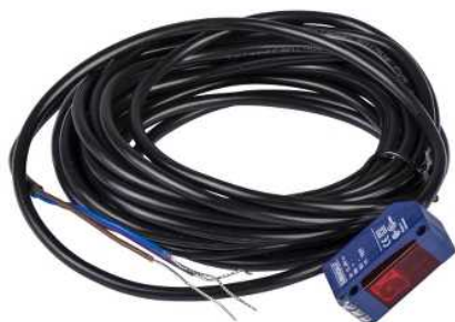
photo-electric sensor - XUM - emitter - 12..24VDC - cable 2m