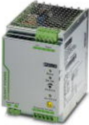
Primary-switched QUINT DC/DC converter for DIN rail mounting with SFB (Selective Fuse Breaking) Technology, with protective coating, input: 24 V DC, output: 24 V DC/20 A

Please be informed that the data shown in this PDF Document is generated from our Online Catalog. Please find the complete data in the user's documentation. Our General Terms of Use for Downloads are valid ( http://phoenixcontact.com/download )