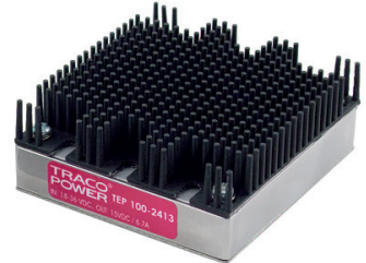
(Models pictured with chassis mount adaptor and optional heatsink)

The TEP-100 Series is a family of isolated high performance dc-dc converter modules with ultra-wide 2:1 input voltage ranges which come in a rugged, sealed metal case.