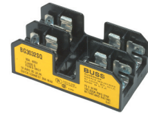
BG and G