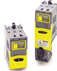
OPM-1038R and OPM-1038RSW