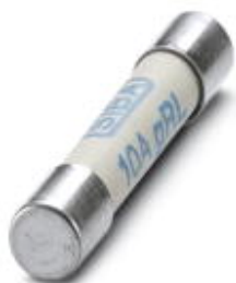
Fuse, nominal current: 10 A, length: 31.8 mm, diameter: 6.35 mm

Please be informed that the data shown in this PDF Document is generated from our Online Catalog. Please find the complete data in the user's documentation. Our General Terms of Use for Downloads are valid ( http://phoenixcontact.com/download )