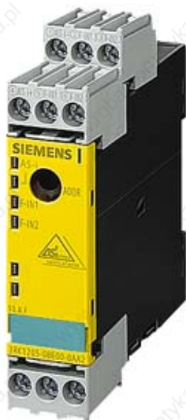
AS-INTERFACE SAFETY AT WORK SLIMLINE S22.5F STANDARD IP20 2F-DI