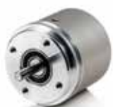
AM58M / AM58B / AM58C / AM58C2 / AM58C3 / AM58D