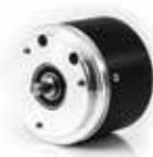
A58M / A58B / A58C / A58C2 / A58C3 / A58D