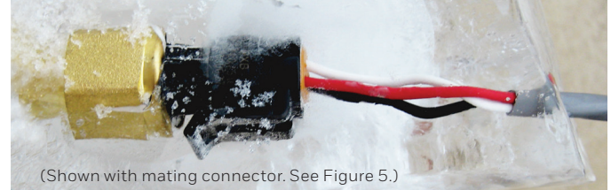
Figure 2. PX3 Series External Freeze/Thaw Resistance