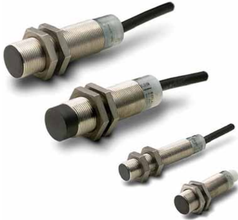
E57P Performance Series Sensors