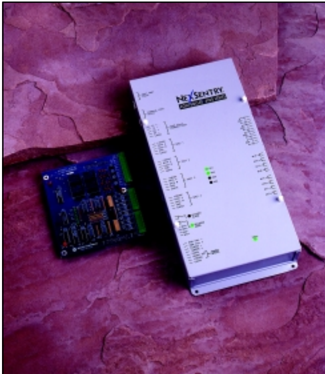
NexSentry 4102 Controller (right) comes with an integrated MIRO daughterboard (left)