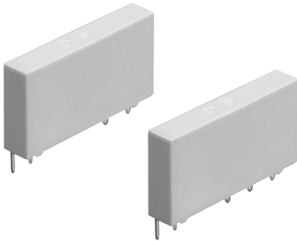
Protective construction: Sealed type