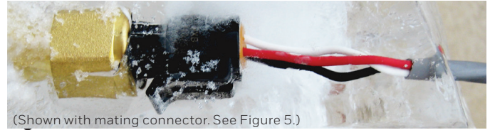
(Shown with mating connector. See Figure 5.)