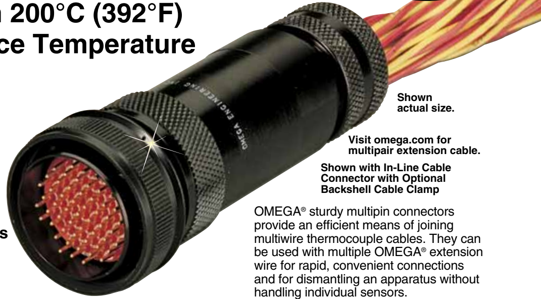
Shown actual size.

Visit omega.com/connector_dimensions Detailed Dimensions