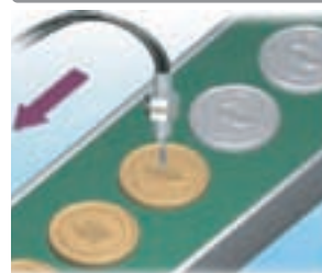
Detecting Products on Conveyors

If you teach the conveyor (i.e., the background), you can detect workpieces even if they have different colors, shapes, or gloss.