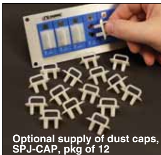
Optional supply of dust caps, SPJ-CAP, pkg of 12

Ordering Example: SPJ-K-F, snap-in panel jack, Type K calibration to accept standard or miniature male connectors.