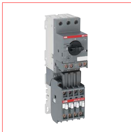
Manual motor starter MS 116.. + contactor A 9.. + connecting link BEA 16/116