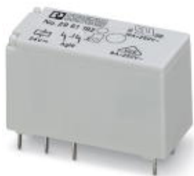
Plug-in miniature power relay, with power contact, 2 PDTs, input voltage 24 V DC

Please be informed that the data shown in this PDF Document is generated from our Online Catalog. Please find the complete data in the user's documentation. Our General Terms of Use for Downloads are valid ( http://phoenixcontact.com/download )