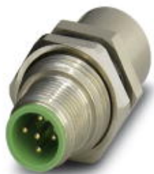
Sensor/actuator control cabinet feed-through, male to female, 5-pos., M12, shielded, B-coded, bipolar/screw mounting with M16 thread

Please be informed that the data shown in this PDF Document is generated from our Online Catalog. Please find the complete data in the user's documentation. Our General Terms of Use for Downloads are valid ( http://phoenixcontact.com/download )