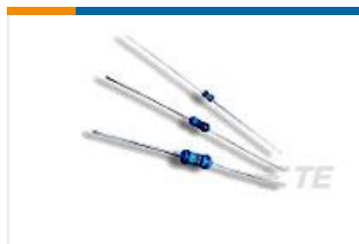
TE Model / Part #1622730-1 LR2 1% 30K