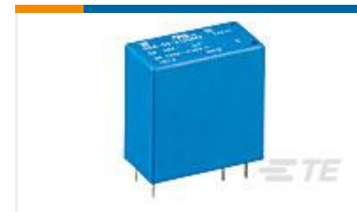
TE Model / Part #5-1419124-6 OSA-SS-212DM3,000