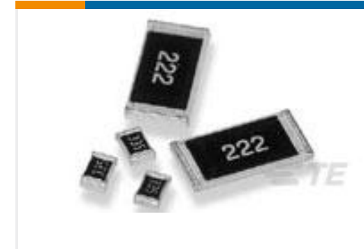
TE Model / Part #6-1879377-4 CRGH0805 5% 390R 0.33W