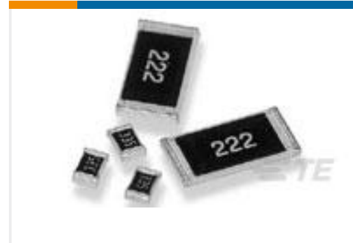
TE Model / Part #3-1879496-7 CRGH0805 5% 390K 0.33W