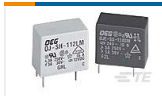
TE Model / Part #1461404-6 OJ-SH-112LM,000