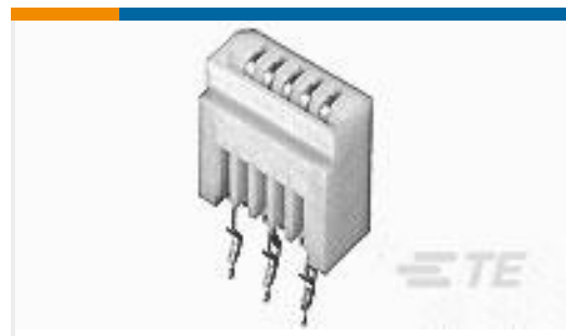
TE Model / Part #3-84984-0 1mm FFC DIP V ASSY 30P TUBE