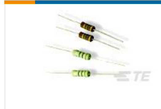
TE Model / Part #5-1625876-7 CBT 1/2 5% 47K