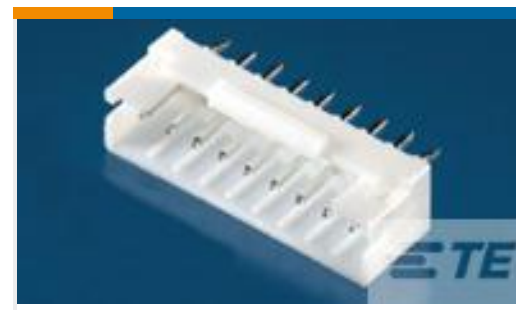
TE Model / Part #1-1735446-2 2MM PITCH HPI POST HEADER, VERTICAL, 12P