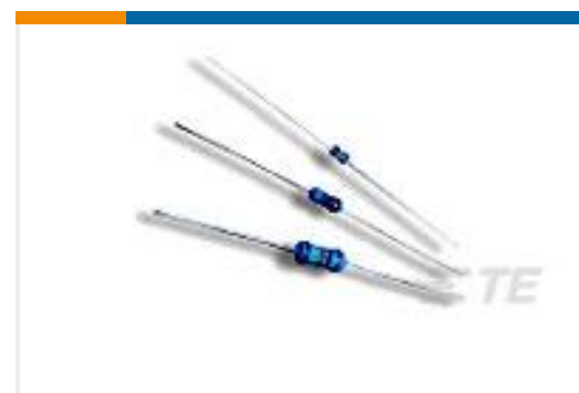
TE Model / Part #6-1879026-4 YR1 0.1% 34R