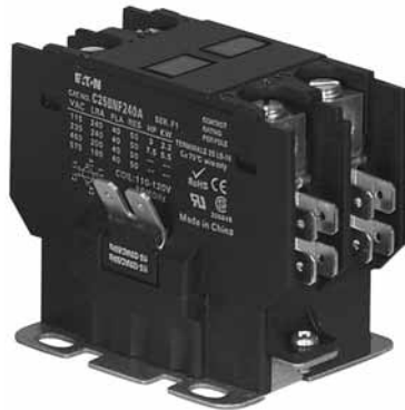
20–40A, Compact Single- and Two-Pole—C25