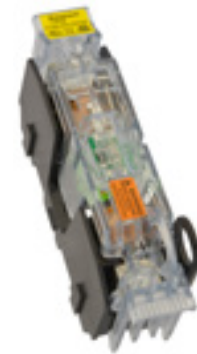
Table 4. Class R fuse block catalog numbers