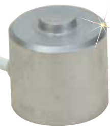
LC304-1K, shown actual size.