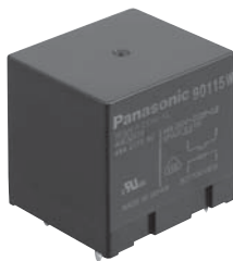
Form A type also available with 48A contact capacity

Refer to data sheet, starting on page 9 .