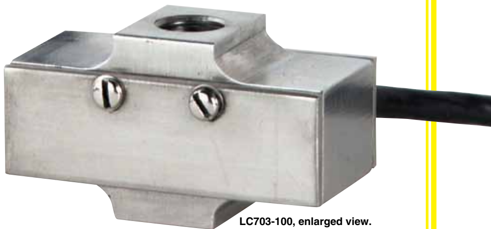
LC703-100, enlarged view.