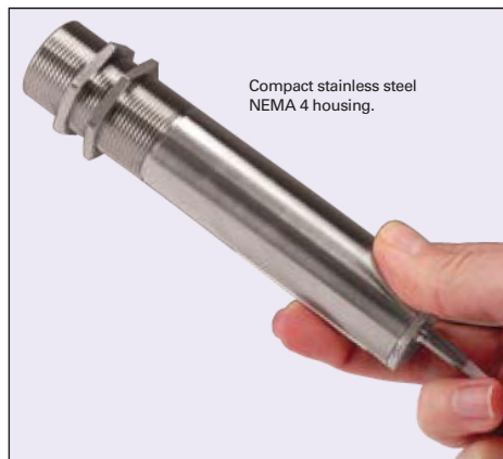
Compact stainless steel NEMA 4 housing.

The Omega compact high performance industrial infrared sensor/transmitter model OS137A provides variety of features and options packaged into a small stainless steel housing. The standard features are adjustable emissivity, 10 to 1 optical field of view, adjustable alarm set point and voltage output to drive external relays, and 6 pre-selected analog outputs that can easily be interfaced to all meters, controllers, data loggers, recorders, computer boards, and PLCs. The unit comes with 2 hex nuts, 1.8 m (6') shielded cable for power and output connections, and operator's manual.