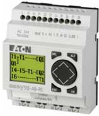
D1 Series General Purpose Relay