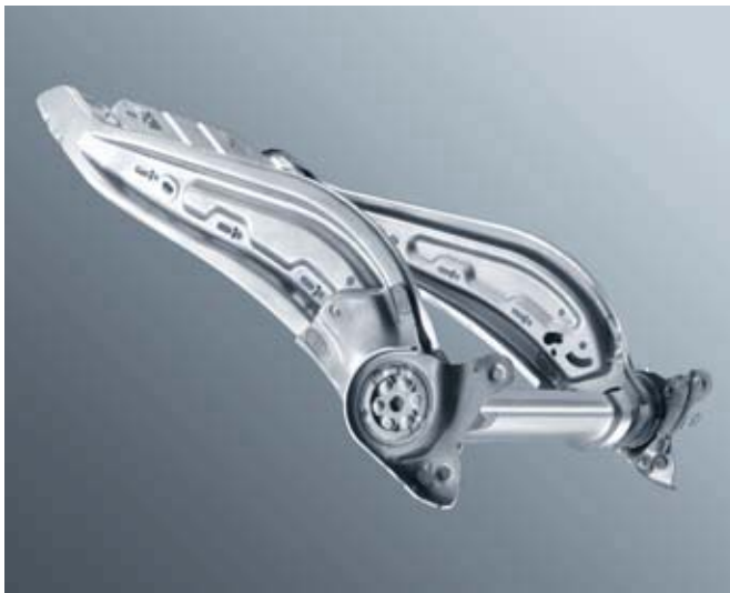
Laser welded seat structure.