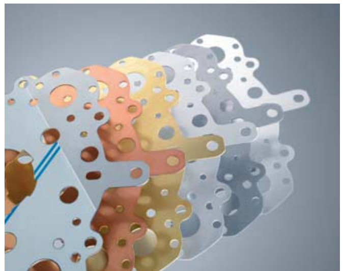
The TruDisk cuts a very wide range of different materials and sheet thicknesses.

When scaling the laser power, the internal power density of the TruDisk lasers always remains in the safe range. Its patented resonator design means that the TruDisk is not sensitive to back reflections and is extremely stable during production. Even highly reflective materials can be processed without limitation. TruDisk lasers also have a noncritical power density for all optical components.