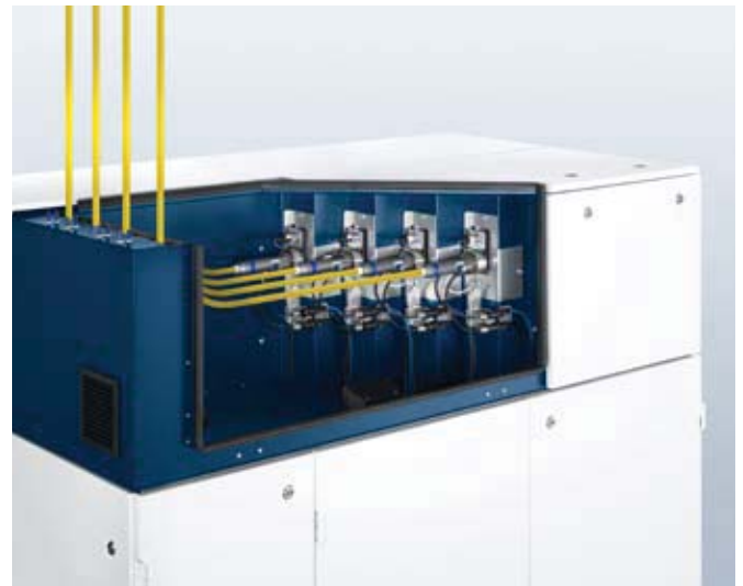
User interface of the TruDisk laser.