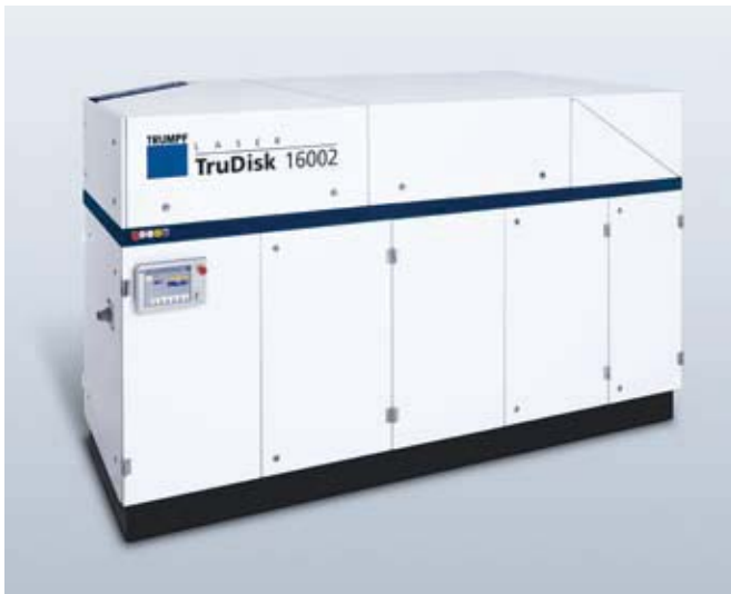
Maximum power: the TruDisk laser with 16 kW.