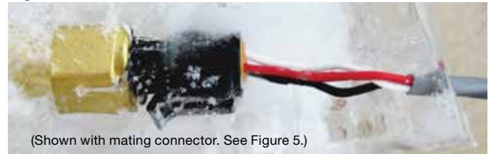
Figure 2. PX3 Series External Freeze/Thaw Resistance