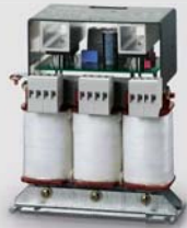
4AV30 up to 4AV33