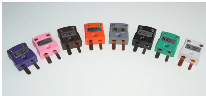
'Thermocouple connector with flat pins'