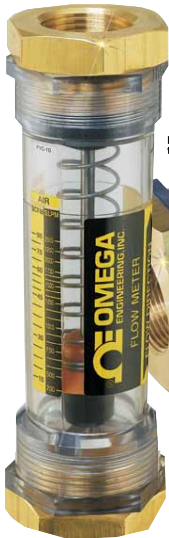
FL-510, shown smaller than actual size.