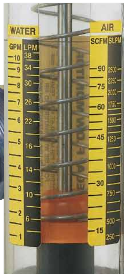
FL-510, shown larger than actual size.