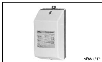
Enclosed type starters

IC operated SUPER MAGNET prevents coil burning and contact welding due to voltage fluctuations See page 01/25.