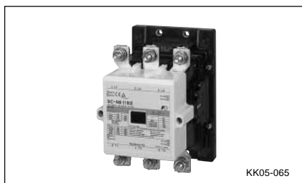
Contactors and starters with SUPER MAGNET

Standard type is usually used to start and stop motors, and to open and close resistance loads like heaters or electric furnaces. See page 01/25.