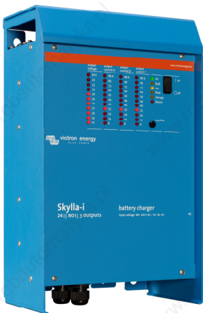
Skylla-i 24/100 (3)