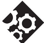
INDUSTRIAL & MANUFACTURING