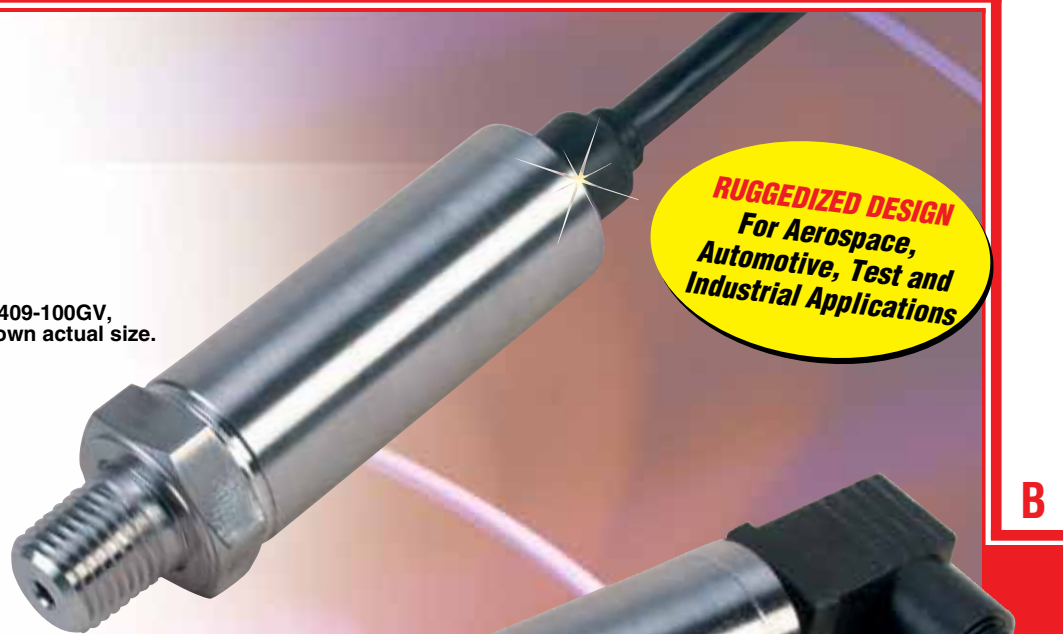
PX419-015GV, shown actual size.

RUGGEDIZED DESIGN For Aerospace, Automotive, Test and Industrial Applications