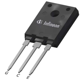
Fully isolated package TO-247