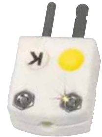
4.93 mm (0.19") wire access hole

We make running changes when technical advances allow. Check at time of ordering for additional features.